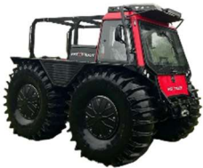
FAT TRUCK® 2.4 PICKUP