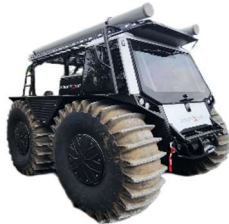
FAT TRUCK® 2.8 PICKUP