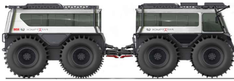
FAT TRUCK® 8X8 WAGON